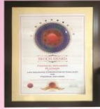
SKOCH award 2018 Platinum category Financial Inclusion