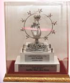
Aashirwad OLI awards