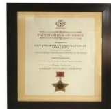
SKOCH Order of Merit -2018 Top 20 Micro Insurance Projects in India-Group Insurance