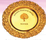
Golden Peacock Award 2017 Excellence in Corporate Governance